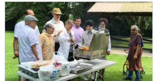
The seniors from Assisted Living out on a picnic last year