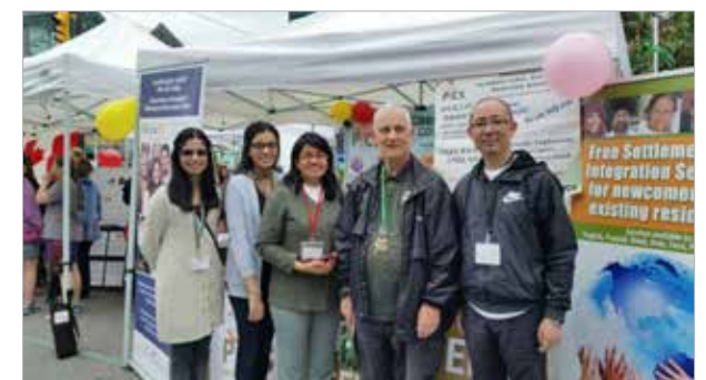
Marpole Summer Festival