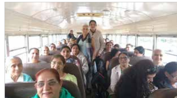
Humjoli Group on a bus trip to Granville Island and Stanley Park