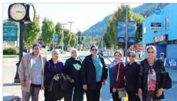
Humjoli Group heads off to Harrison Hot Springs!