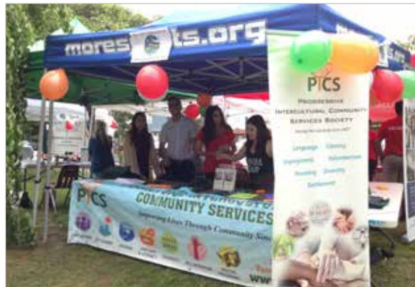
PICS booth at Sunset Community Centre